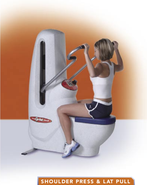
SHOULDER PRESS & LAT PULL

HOGGAN Sprint Circuit includes seven multi-functional training stations, each focusing on a different area of the body. When used as a complete training program, HOGGAN Sprint Circuit provides a quick, uncomplicated, fun and effective total-body workout.