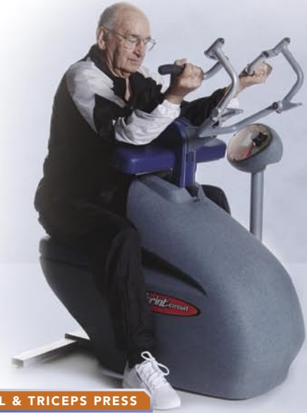
BICEPS CURL & TRICEPS PRESS