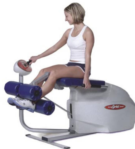
LEG EXTENSION & CURL