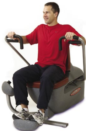
CHEST PRESS & ROW