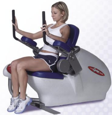
AB FLEXION & BACK EXTENSION