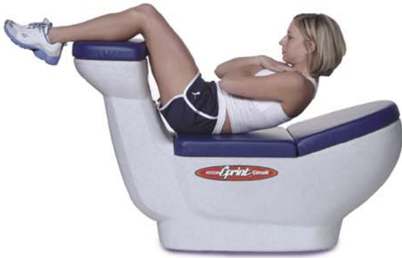
CORE TRAINING STATION