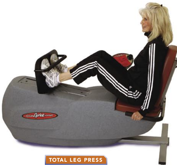
TOTAL LEG PRESS